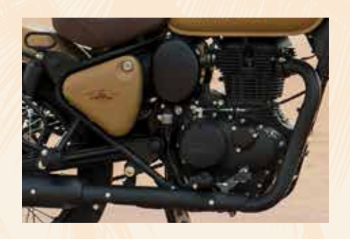
Central to the All-New Classic 350 is an All-New heart that beats to a uniquely Royal Enfield rhythm - The J Series Engine.