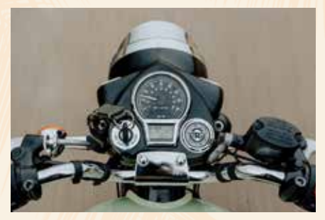
The instrument cluster combines the gracefulness of a 'dancing needle' analogue speedometer with the functionality of an LCD display.