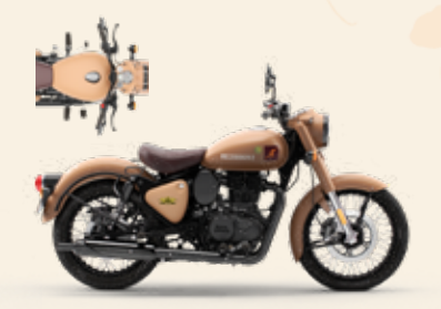
SIGNALS DESERT SAND