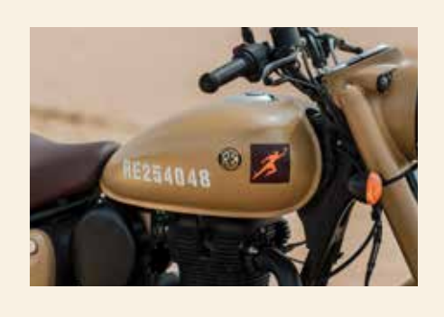
The hallmark teardrop Fuel Tank, true to the Timeless Classic design.