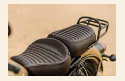
Endowed with comfort; comes fitted with a wide seat that cossets its rider.