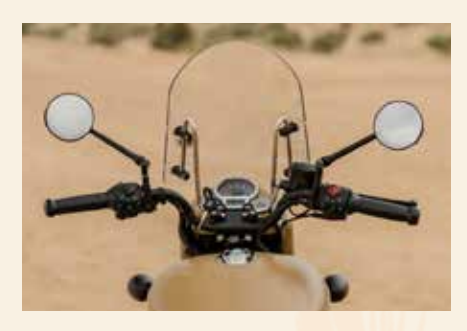
Equipped with wider bars and tyres for effortless and secure manoeuvrability.