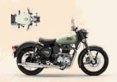
REDDITCH SAGE GREEN