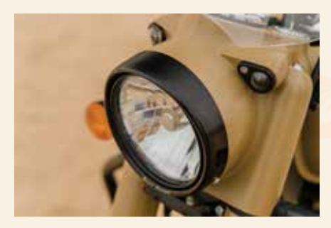
Powerful multi-reflector headlights that light up the night ride.