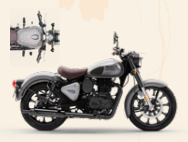
DARK GUNMETAL GREY