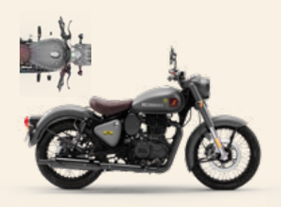
SIGNALS MARSH GREY