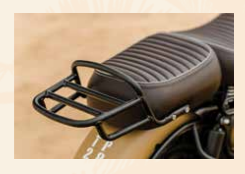
Strengthened grab rail for a more relaxed ride for those riding pillion.