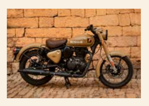
The All-New Classic sports a new twin downtube chassis that rides Strong and True.