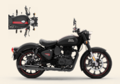
DARK STEALTH BLACK