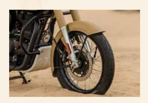
The larger diameter brakes beef up the stopping power.