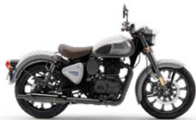
DARK GUNMETAL GREY