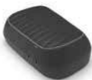
BLACK TOURING PASSENGER SEAT