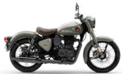
SIGNALS MARSH GREY