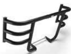
BLACK AIRFLY ENGINE GUARD