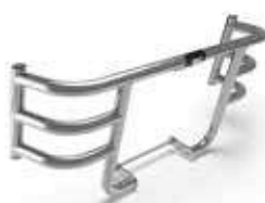
SILVER AIRFLY ENGINE GUARD