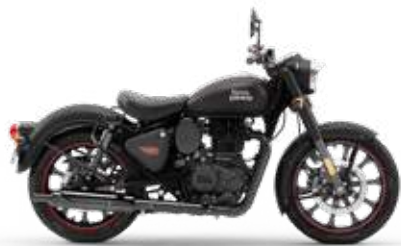
DARK STEALTH BLACK