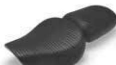
BLACK PLEATED SEAT COVERS