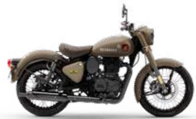
SIGNALS DESERT SAND