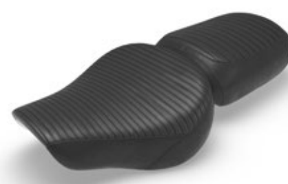
BLACK PLEATED SEAT COVERS