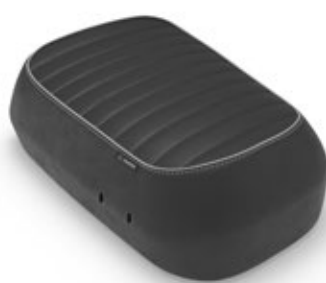
BLACK TOURING PASSENGER SEAT