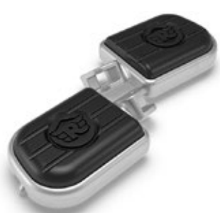
SILVER DELUXE FOOTPEGS