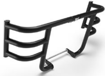
BLACK AIRFLY ENGINE GUARD