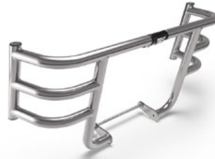
SILVER AIRFLY ENGINE GUARD