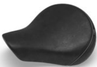
BLACK LOW RIDE RIDER SEAT