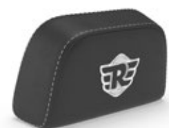
BLACK PASSENGER BACKREST PAD