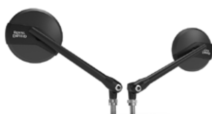
BLACK TOURING MIRRORS