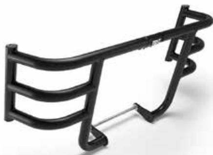
BLACK AIRFLY ENGINE GUARD