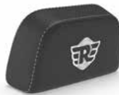
BLACK PASSENGER BACKREST PAD