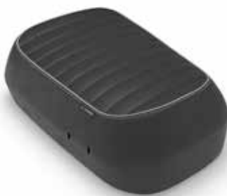
BLACK TOURING PASSENGER SEAT