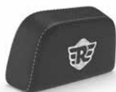
BLACK PASSENGER BACKREST PAD