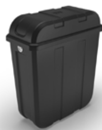
BLACK COMMUTER PANNIER