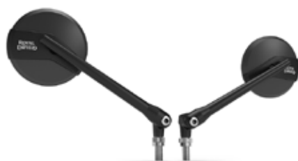
BLACK TOURING MIRRORS