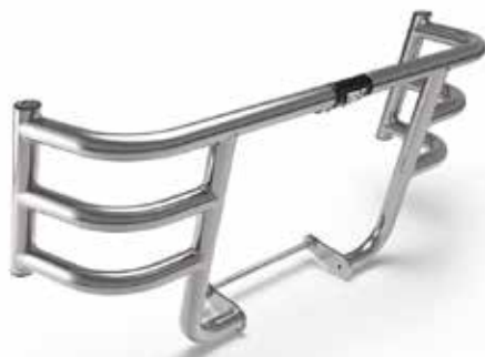
SILVER AIRFLY ENGINE GUARD