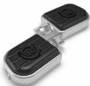
SILVER DELUXE FOOTPEGS