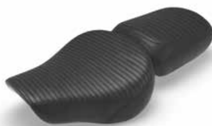
BLACK PLEATED SEAT COVERS