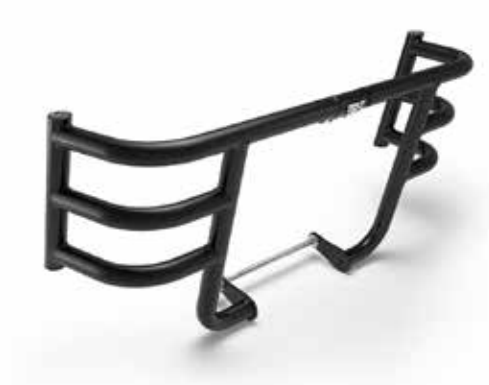
BLACK AIRFLY ENGINE GUARD