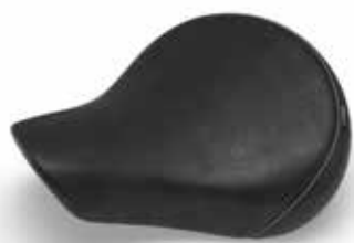
BLACK LOW RIDE RIDER SEAT