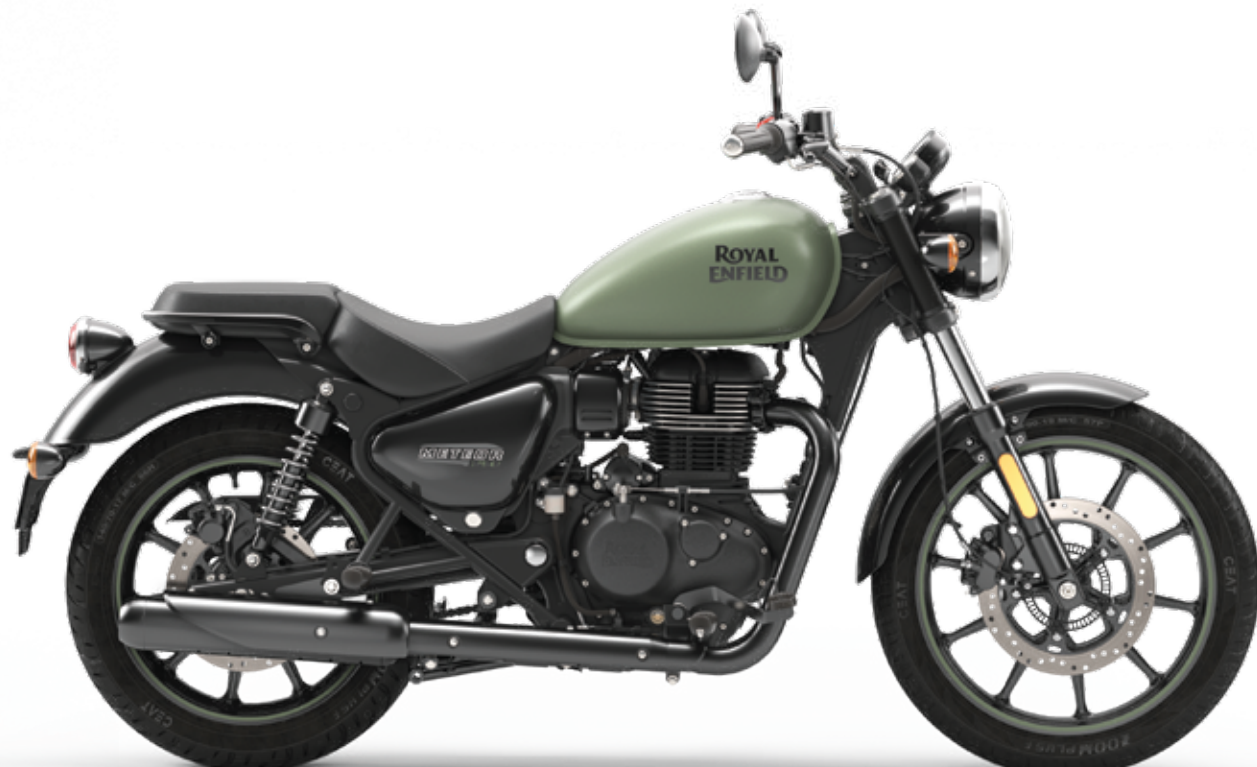
Fireball Matt Green