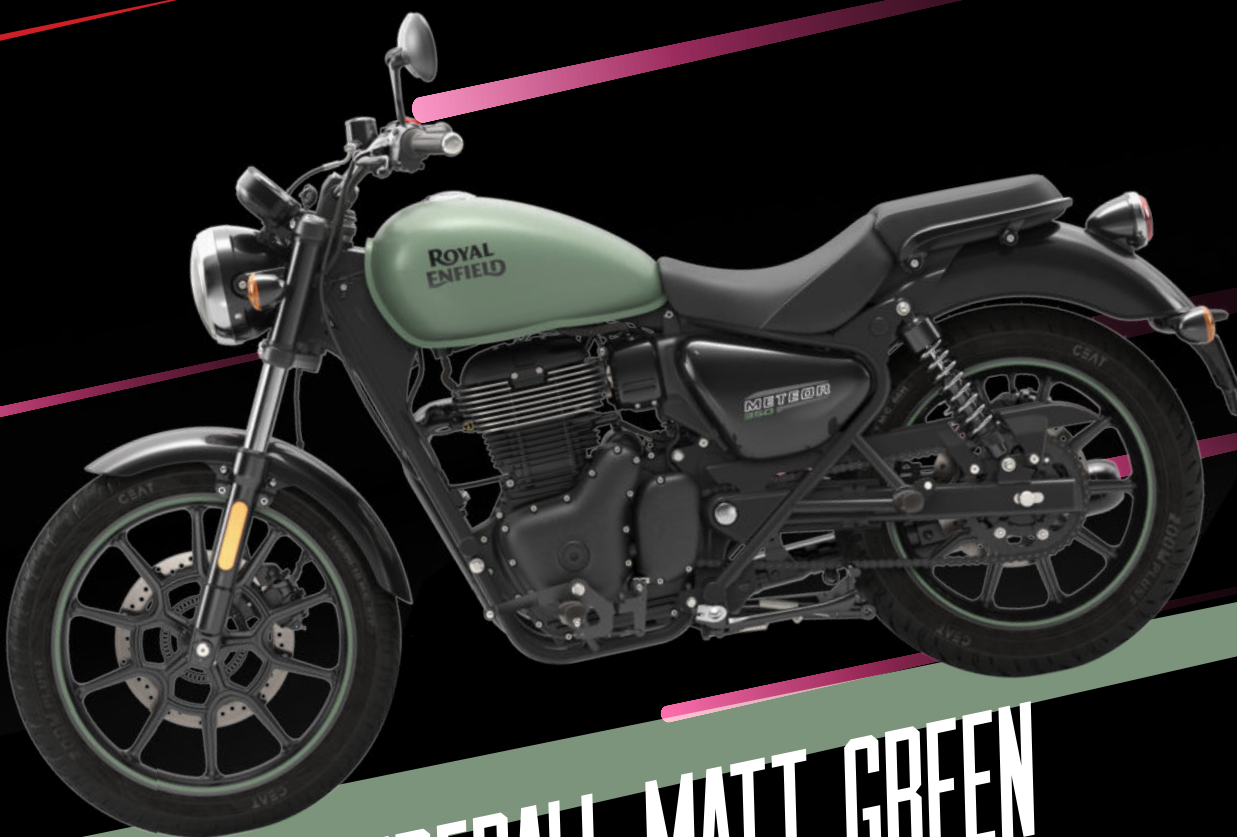
FIREBALL MATT GREEN