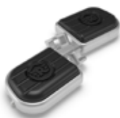
SILVER DELUXE FOOTPEGS