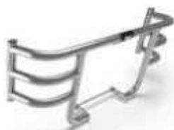
SILVER AIRFLY ENGINE GUARD