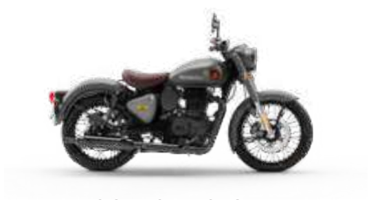
SIGNALS MARSH GREY