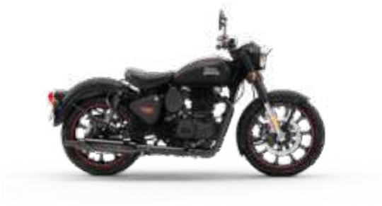
DARK STEALTH BLACK