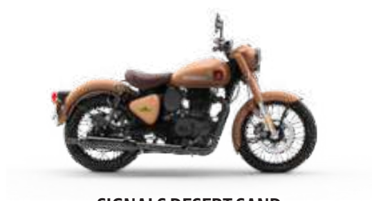
SIGNALS DESERT SAND