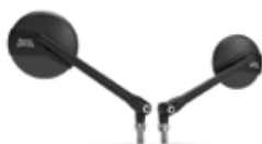
BLACK TOURING MIRRORS