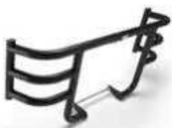
BLACK AIRFLY ENGINE GUARD