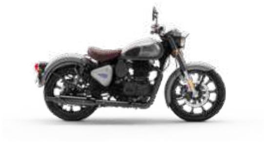
DARK GUNMETAL GREY