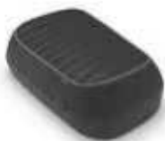
BLACK TOURING PASSENGER SEAT