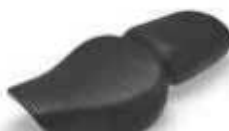
BLACK PLEATED SEAT COVERS