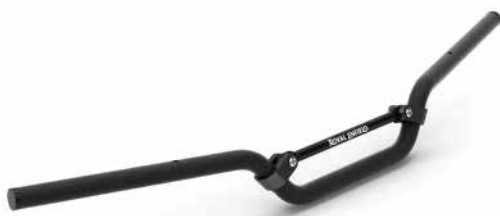
BLACK HANDLEBAR BRACE PAD