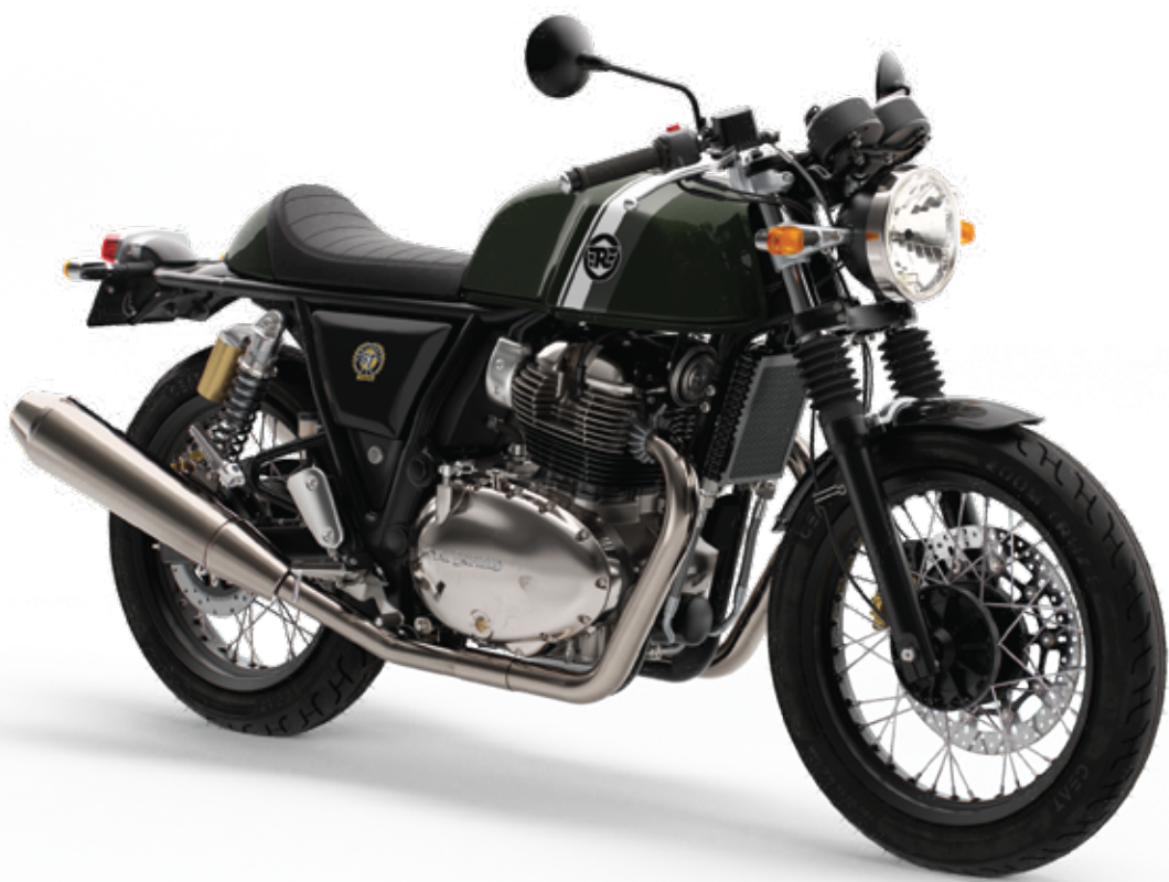
British Racing Green