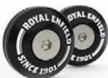
INTAKE COVER KIT, BLACK 1990442