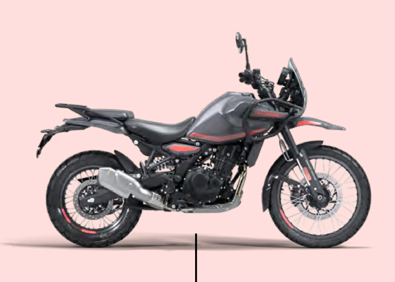
SLATE HIMALAYAN SALT