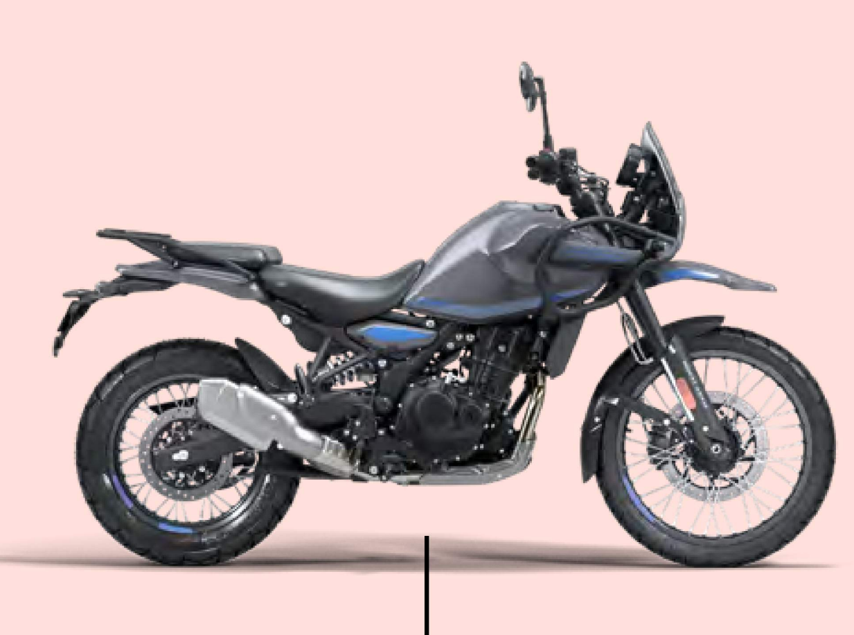
SLATE POPPY BLUE