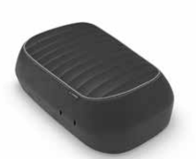
BLACK TOURING PASSENGER SEAT