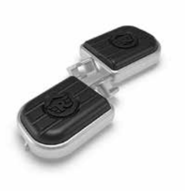
SILVER DELUXE FOOTPEGS