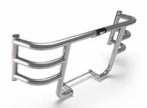
SILVER AIRFLY ENGINE GUARD