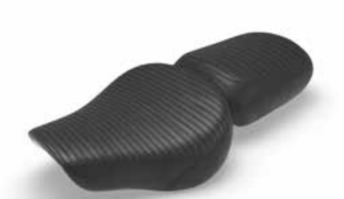
BLACK PLEATED SEAT COVERS