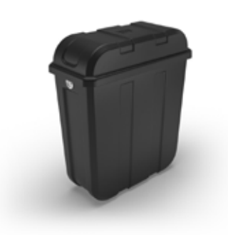
BLACK COMMUTER PANNIER