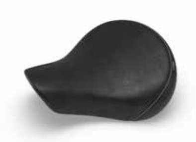
BLACK LOW RIDE RIDER SEAT