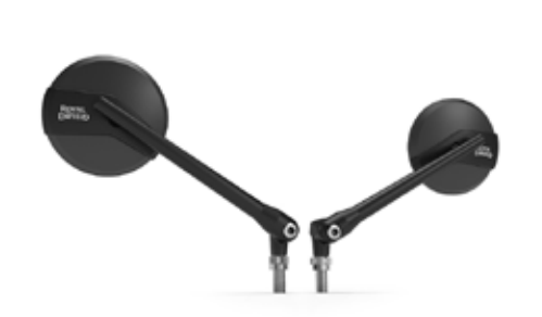
BLACK TOURING MIRRORS